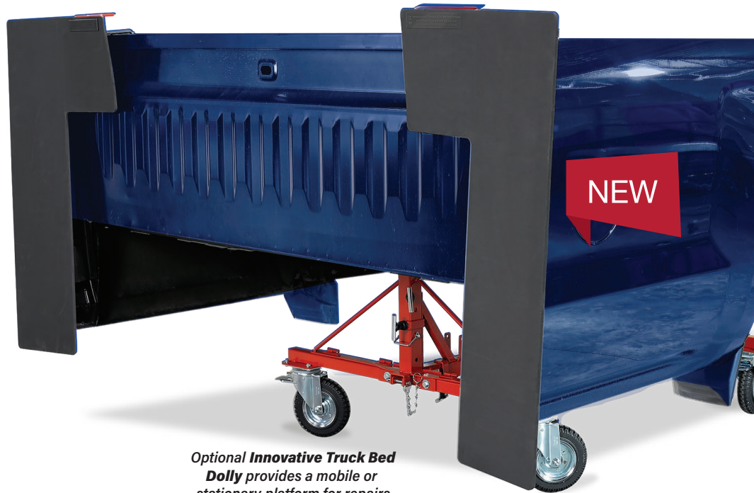
Optional Innovative Truck Bed Dolly provides a mobile or stationary platform for repairs