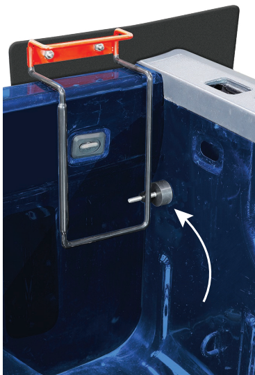
Adjustable knob keeps pads parallel to truck bed sides