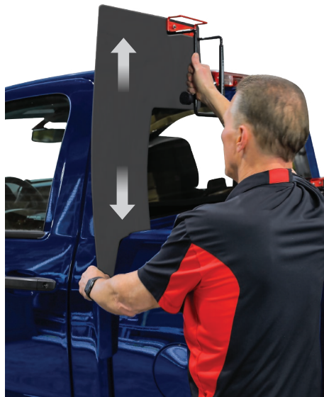
Innovative Cab Protectors slide into position in seconds between cab and box - whether removing or reinstalling the truck bed