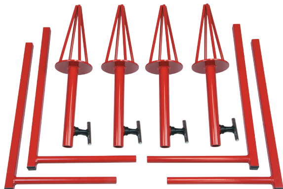
Four support arms and four Wheel Mount brackets.