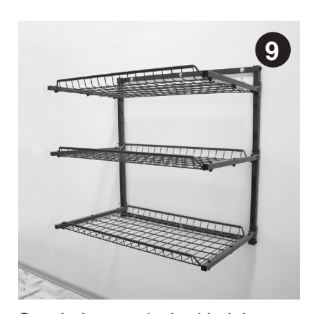
Set shelves at desired heights.