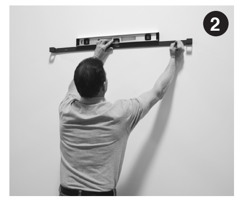
Set top crossbar at desired top shelf height. Level crossbar and mark holes 16" on center.