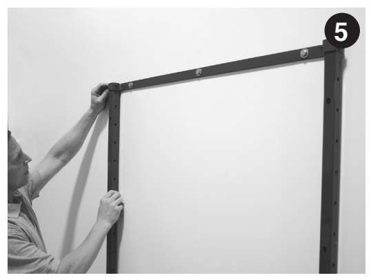
Insert side rails. Do not tighten bolts yet.