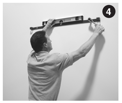
Tighten lag bolts with 9/16" socket wrench. Confirm leveling before final tightening.