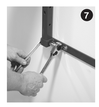
Tighten side rail bolts using 9/16" socket and 9/16" end wrench.