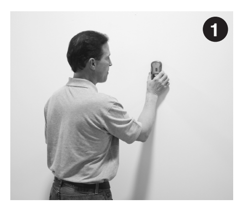
Locate 16" studs on center. All crossbar holes must hit studs in wall. This step not required on masonry walls.