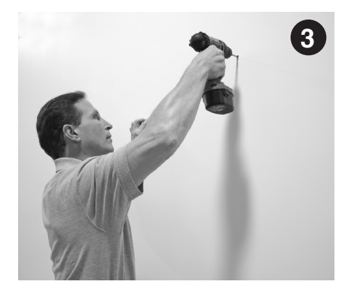
Using a 9/32" bit, drill pilot holes for top crossbar. For masonry walls, pre-drill using 1/4" masonry bit followed by 5/8" masonry bit. Insert lead anchor.