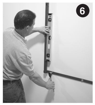
Bolt lower crossbar to side rails. Plumb side rails, mark holes. Pre-drill using 9/32" bit. Tighten lower crossbar bolts.