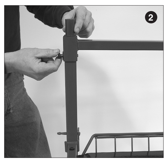
Insert RO Bracket (P/N 290-40) into upper frame support. Reinstall 3/8" hex bolt and tighten.