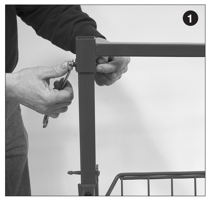
Remove 3/8" hex bolt from upper frame support.