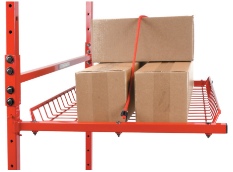
Secure boxes on shelves with supplied bungee cords.