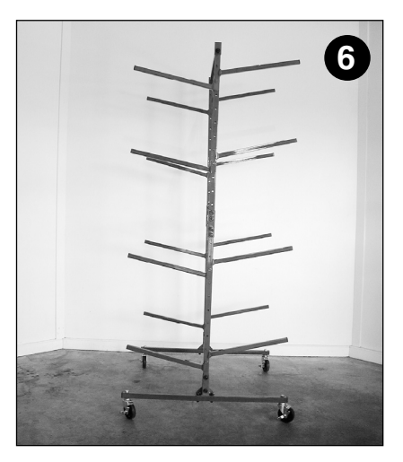
Put support arms in desired positions. Note: the four longer support arms are normally in the topmost positions.