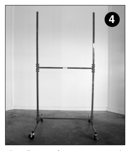
Install center frame support and last two side rail tubes (P/N 290-026).