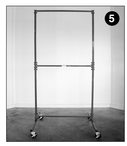
Install upper frame support, then tighten all bolts.