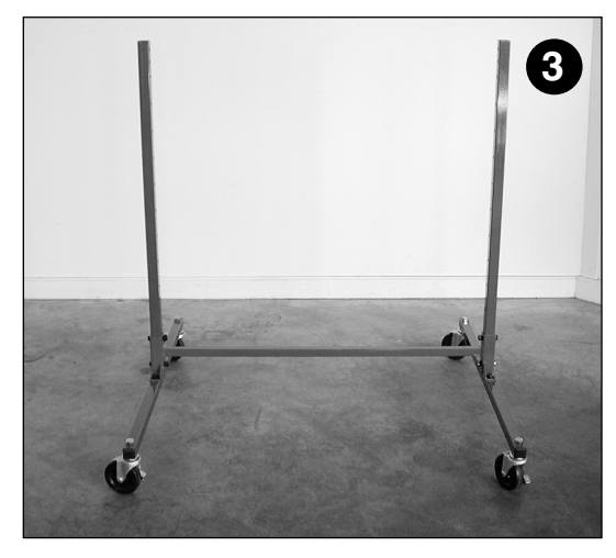
Slide longer side rail tubes (P/N 290-005) into lower base support, insert bolts. Note: do not tighten bolts until frame is completed.