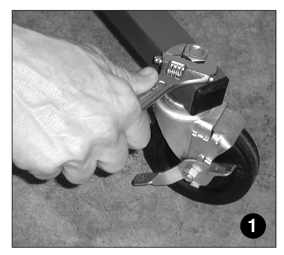
Install wheels to leg support tubes.