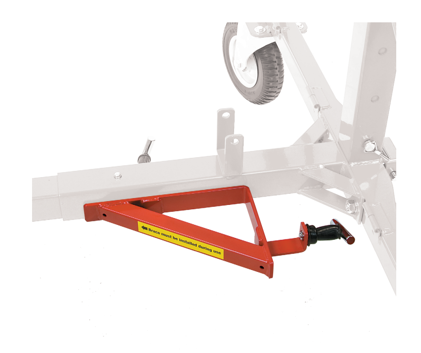
Shows where to store Quick Release Support Bracket when Truck Bed Dolly is in collapsed position.