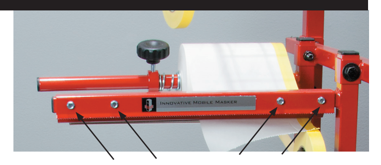
Step one: Remove four screws using a 5/16 inch socket

Step two: Grind back edge of blade using 50 grit grinding disc