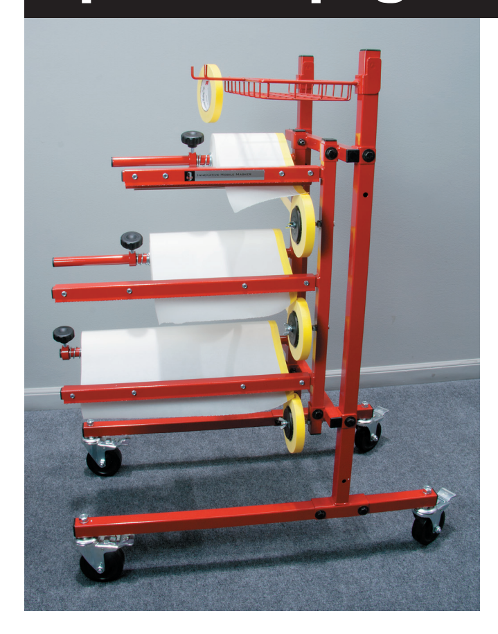
Innovative Mobile Masker (Part # I-MM) is shown. This technique applies to all Innovative Tools masker blades.