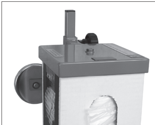
Smaller boxes fit inside upper and lower box caps.